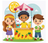
Start a Business